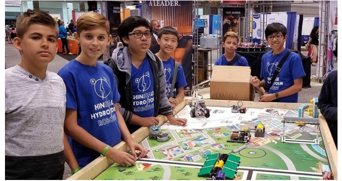
Top Left: Hinsdale Fil-Am church embarks on their mission trip to Puerto Rico Bottom Left: The Prayer Walk at HAA rededicated the school & staff to God's purpose Above: The HydroStorm Robotics Team works as exhibitors during the NAD Teacher Convention