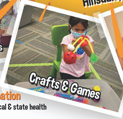
Crafts & Games