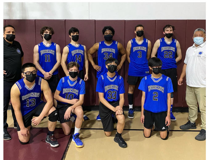
Boys Volleyball Team