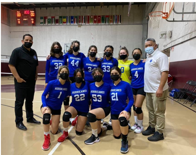
Girls Volleyball Team