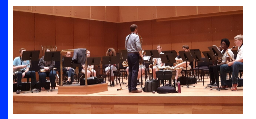
For the first time ever, four HAA students participated in the All State Band Day at Illinois State University. The day included concerts, master classes, and audition preparation.