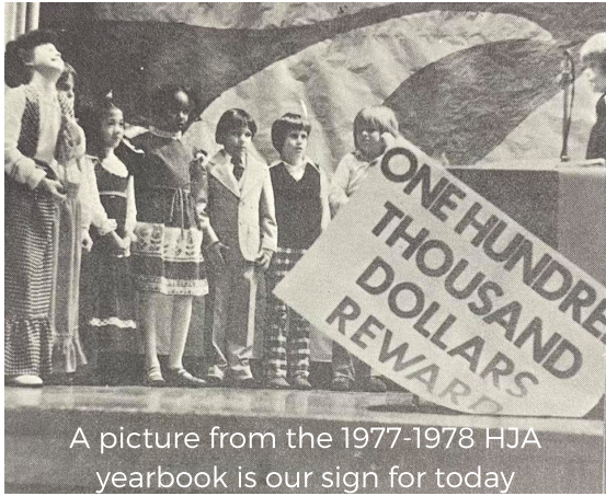
A picture from the 1977-1978 HJA yearbook is our sign for today

Imagine a school filled with joyous children reading, making music, studying, playing sports, making friends, and learning about Jesus. That place is HAA and now we have the opportunity to extend that vision to students throughout Chicagoland and grow both academic and extra-curricular programs.